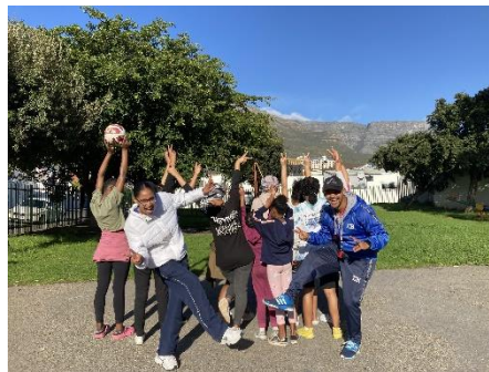
Outreach at Ons Plek project (Afrikaans for 'Our Place', Woodstock.

Another thank you is extended to Western Province Hockey Association. Every 3 months different volunteers from Germany in partnership with WP Hockey come and serve our hubs by providing quality hockey coaching sessions.