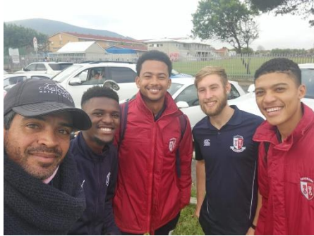
Aslan Coaches at Panorama Primary School