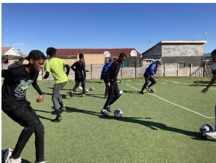
Practicing some core skills