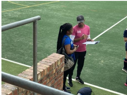
Aslan HIS Coaches at Herschel Girls