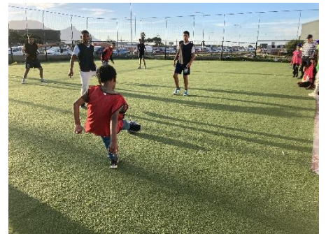
St Paul's Church Lavender Hill