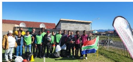
Academy equipment kit hand over

Snap shots of Academies in action at their churches: