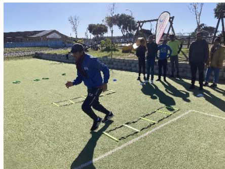
Going through speed, agility & quickness