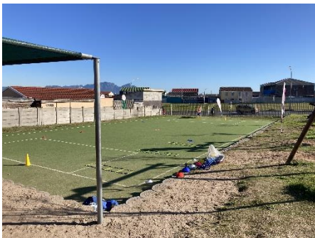
Equipment all set up for practical