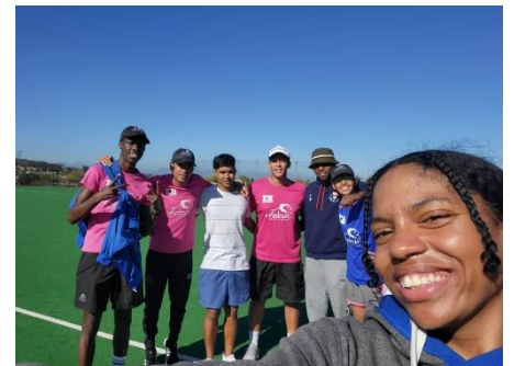
Coaches at Reddam House Durbanville

As well as our regular outreach programmes in disadvantaged communities, Aslan promotes positive values through its coaches who work in several schools in the Northern and Southern Cape Town Suburbs including Reddam House, Durbanville Prep & College, Panaroma Primary, Herschel Girls, Claremont and Esprit Academy Durbanville . We provide sports coaching for hockey, soccer, multi skill and cricket.