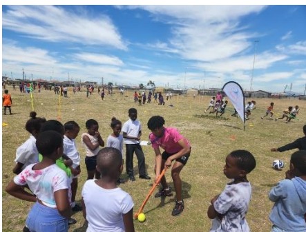
MW 2022 Mpendulo Primary School Khayelitsha