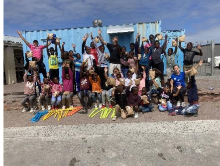
Outreach at Marconi Beam Primary School in Joe Slovo town, doing hockey

Another thank you is extended to Western Province Hockey Association. Every 3 months different volunteers from Germany in partnership with WP Hockey come and serve our hubs by providing quality hockey coaching sessions.