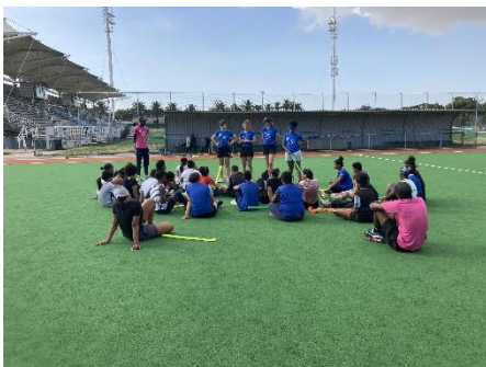
Outreach at Ons Plek Mowbray

These values have been extremely present in moments where problems of life have been very evident at most of our weekly sports sessions with our young people but with these values we have been able to offer help and encouragement and instill hope through God's love.