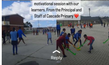
MW 2022 Cascade Primary Mitchells Plain