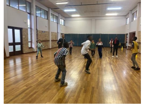
St John's Church Wynberg