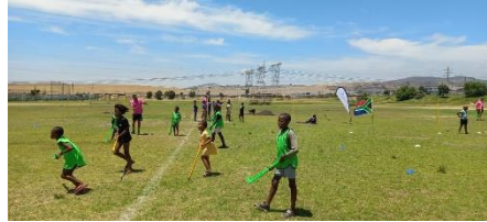
MW2022 Du Noon Township