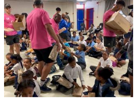
MW 2022 Trinity School Mitchells Plain