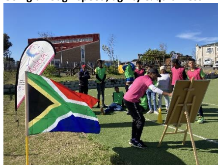
Last important points