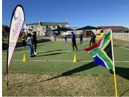
Understanding why set up is important