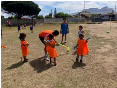
MW 2022 Woodlands Primary Heideveld

Again, thank you for all you do for our young people and team.