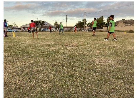
AFM Pneuma Church Grassy Park